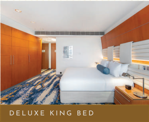
DELUXE KING BED