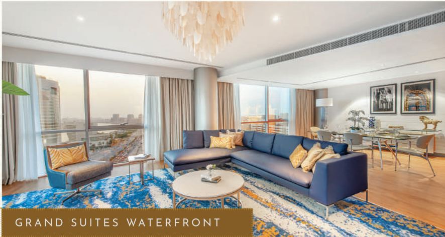
GRAND SUITES WATERFRONT