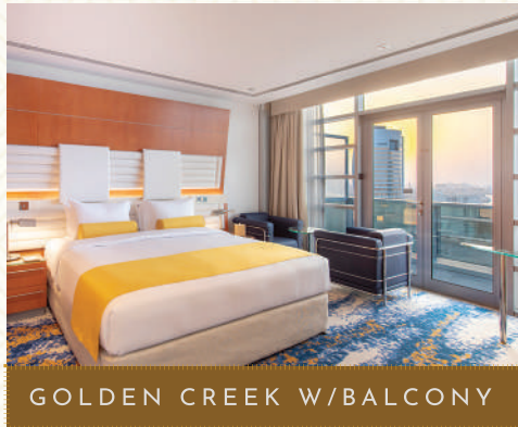
GOLDEN CREEK W/BALCONY